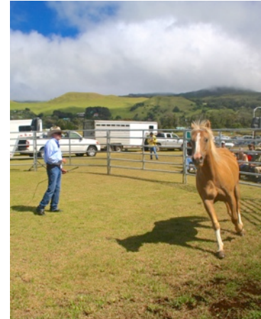
From the 2012 Hawaii Horse Expo at the Paniolo Heritage Center, Pukalani Stables

To preserve and promote the heritage of the Hawaiian cowboy through the Paniolo Cultural Center at Pukalani Stables. The Paniolo Preservation Society celebrates the Hawaiian ranching industry and the accomplishments of the generations of paniolo that made that industry possible. Our focus is statewide and represents all cowboys from all of the Hawaiian islands. PPS is committed to increasing public awareness of the historical, present-day and future significance of Hawaii's ranching industry and the honored traditions of its paniolo.